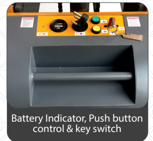
Battery Indicator, Push button control & key switch