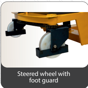
Steered wheel with foot guard