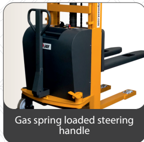
Gas spring loaded steering handle